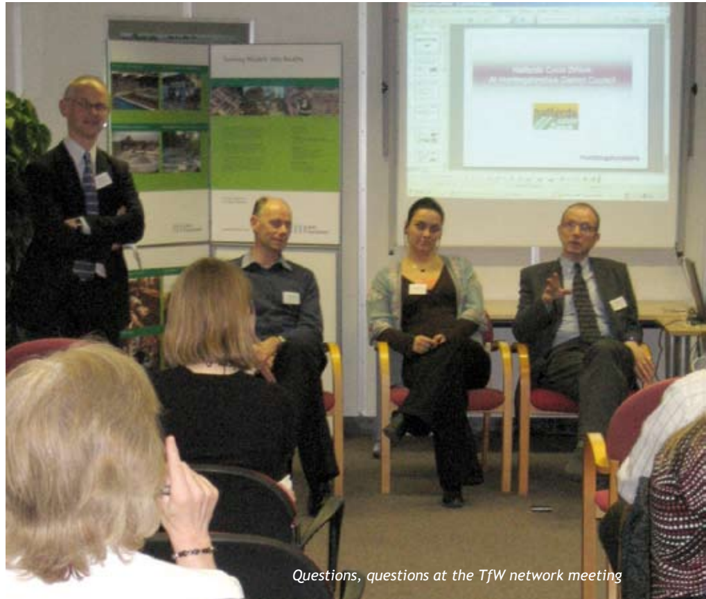
Questions, questions at the TfW network meeting