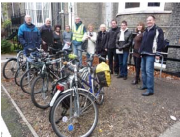
MPW College received support for 10 cycle stands for their staff

Free stands and matched funding for installation of cycle parking for employees is still available to TfW employers from the Take A Stand scheme—so get your application to us by 7th January . Application forms and guidance notes are available from http://www.tfw.org.uk/news.php#takeastand10 Funding for Take A Stand comes from the Cycle Cambridge Team at the County Council