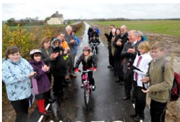
Sawston – Babraham cycleway opening

Over the last few weeks 'Cycle Cambridge' has opened a number of new cycle routes to help boost cycling in Cambridge and the surrounding areas. Commuting cyclists will want to try-out the following: