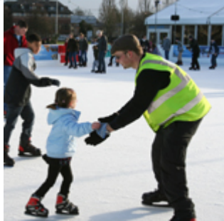
Cambridge on Ice

The Cycle Cambridge team and Ben Hayward Cycles will be at Cambridge on Ice on Parker’s Piece from 4-7pm on Wednesdays 24 November, 8 and 15 December,