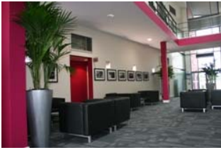
'Works in Print' original art