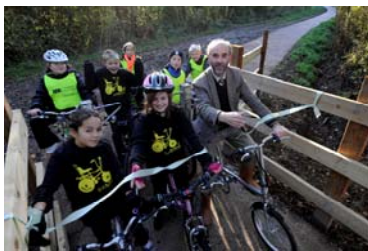
Bar Hill - Dry Drayton