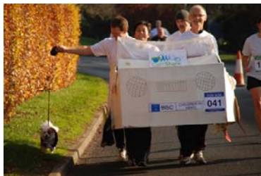
TP+ & TfW in the Fun Run 'CamShare Car'