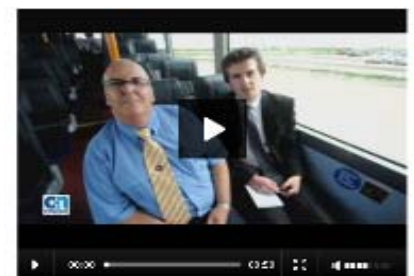
Busway driver training in the news

http://www.youtube.com/user/CambsCountyCouncil