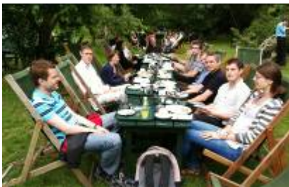
CCDC enjoy a bike ride and cream tea in Grantchester

Cambridge Crystallographic Data Centre (CCDC) funded cycle hire and cream tea at the Orchard in Grantchester for staff on their Bike Week cycle ride (below).