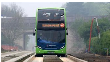
Live guided bus countdown to launch on Sunday 7th August

A great development is the new Busway Smartcard which, allows passengers to travel on both Stagecoach and Whippet Busway services with just one ticket. Log on to www.cambridgeshire.gov.uk/buswaytickets from Monday 1 August for further information and to apply for your Busway Smartcard online.