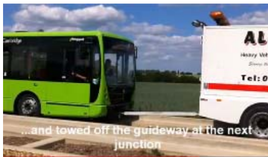
Busway breakdown recovery test

http://www.youtube.com/user/CambsCountyCouncil