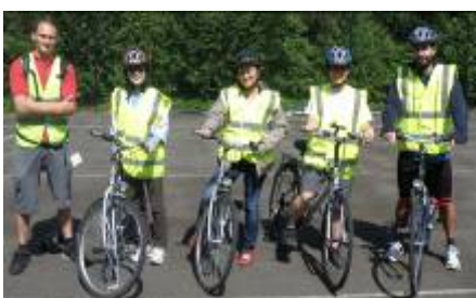
Left: Wellcome Trust staff undertake level 1 Cycle Training provided by Outspoken

There's a lot more summertime left so don't wait for Bike Week 2012 to organise similar events at your workplace. Organisers do contact TfW for advice and ideas.