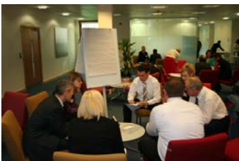
Working group busily considering the Mills & Reeve Issues

The meeting then heard from Mills & Reeve and English Heritage , both organisations at early stages of developing solutions to their own car park problems. The meeting split into working groups to come up with suggestions on how to resolve the issues facing these two companies. The outcomes from the workshop activities are summarised in the following document Workshop Exercise .